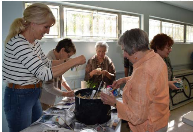
Winter food for our feathered friends.