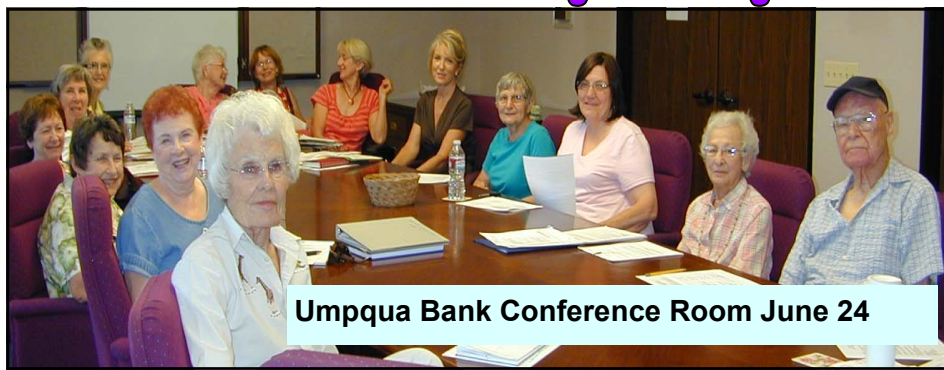
Umpqua Bank Conference Room June 24