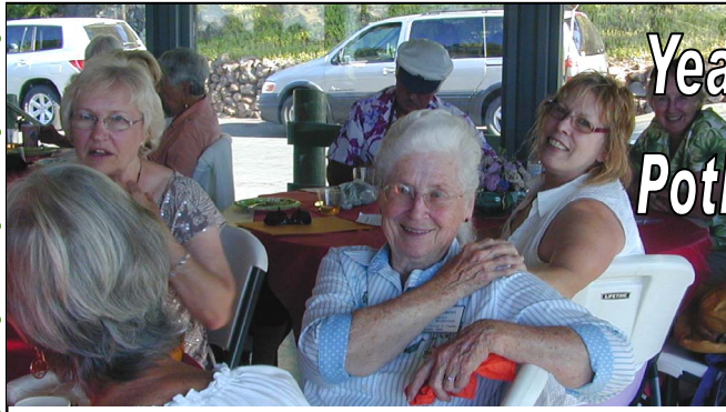
Year End Potluck &