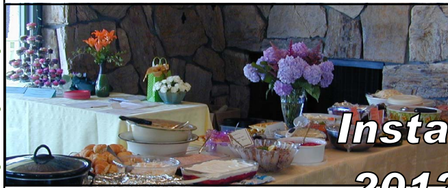
Installation of 2012 Officers