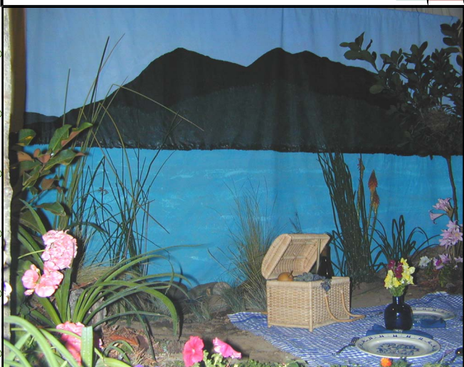
Lake Co is Pretty as a Picture - 3rd Place