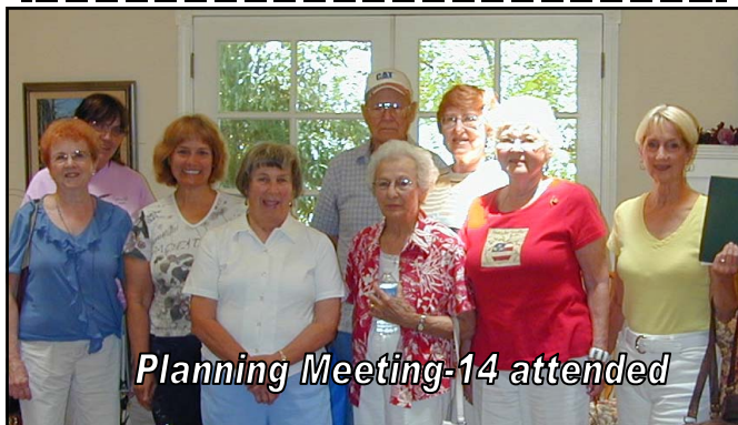
Planning Meeting-14 attended