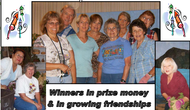
Winners in prize money & in growing friendships