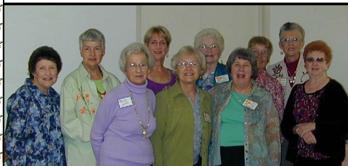
Good turnout for the Mendo-Lake District Meeting. Pictured are only some of the worker bees.