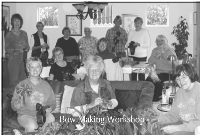
Bow Making Workshop

The most pleasurable, gratifying, remembered, long-lasting gift I received growing up!